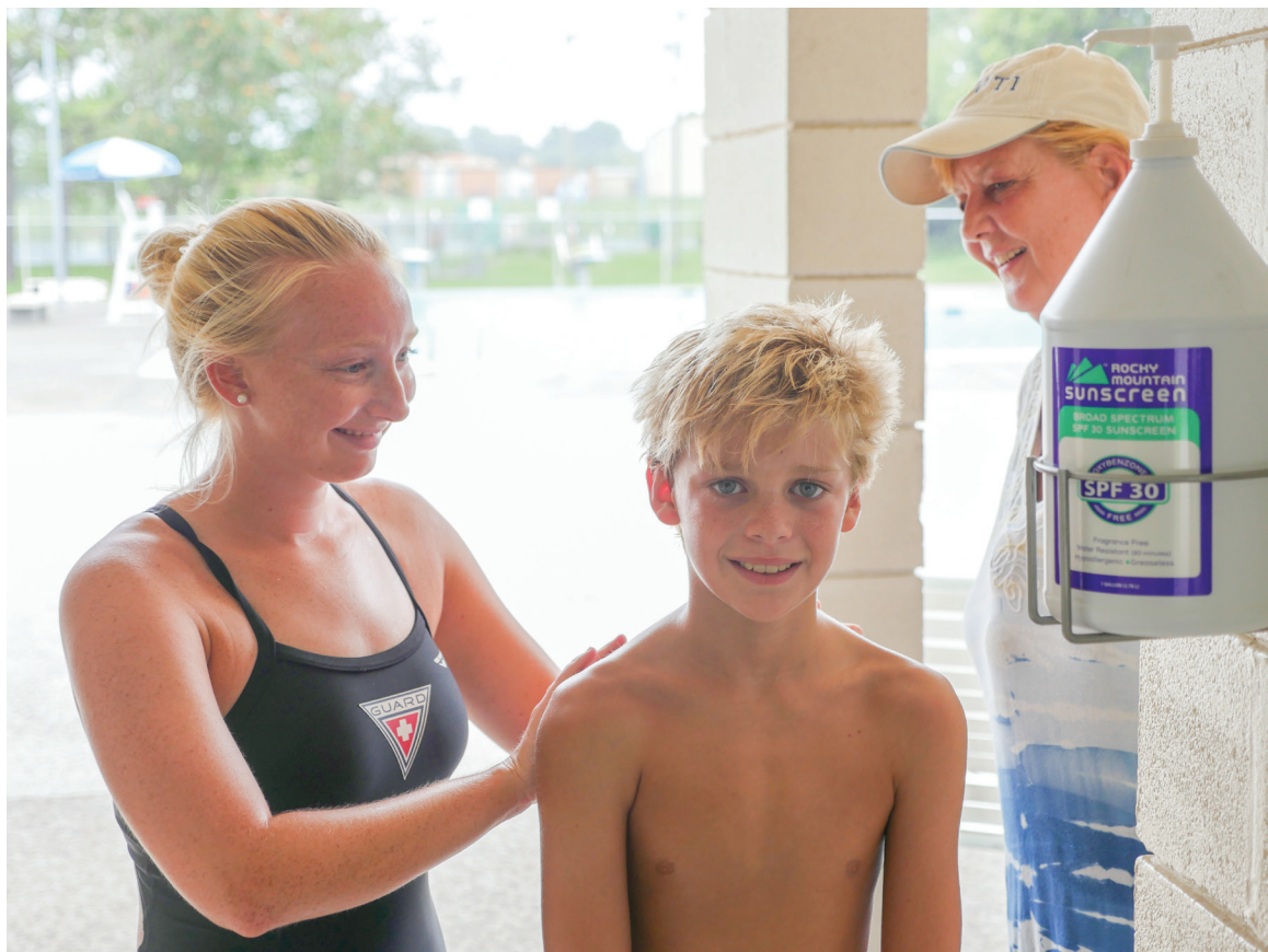
SPF sunscreen dispenser at local community pool being utilized by a lifeguard and swimmer.