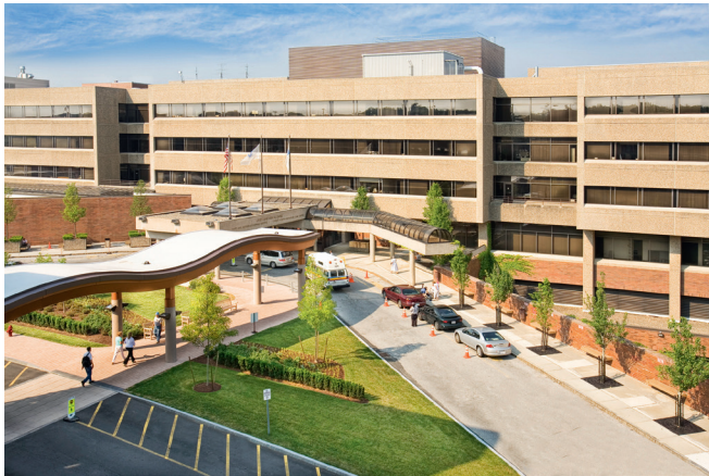
Lahey Hospital and Medical Center