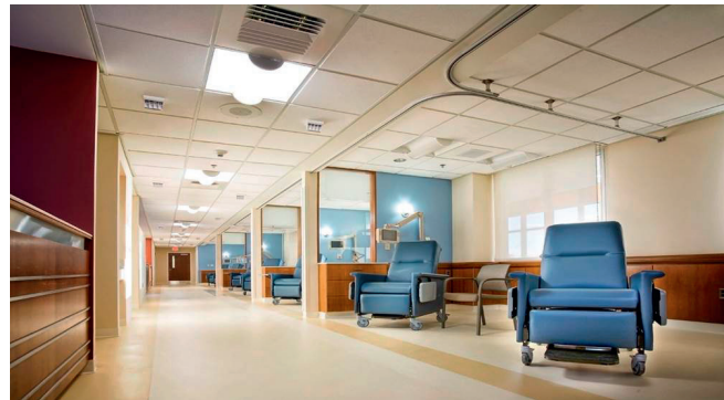
Infusion center at the Sophia Gordon Cancer Center