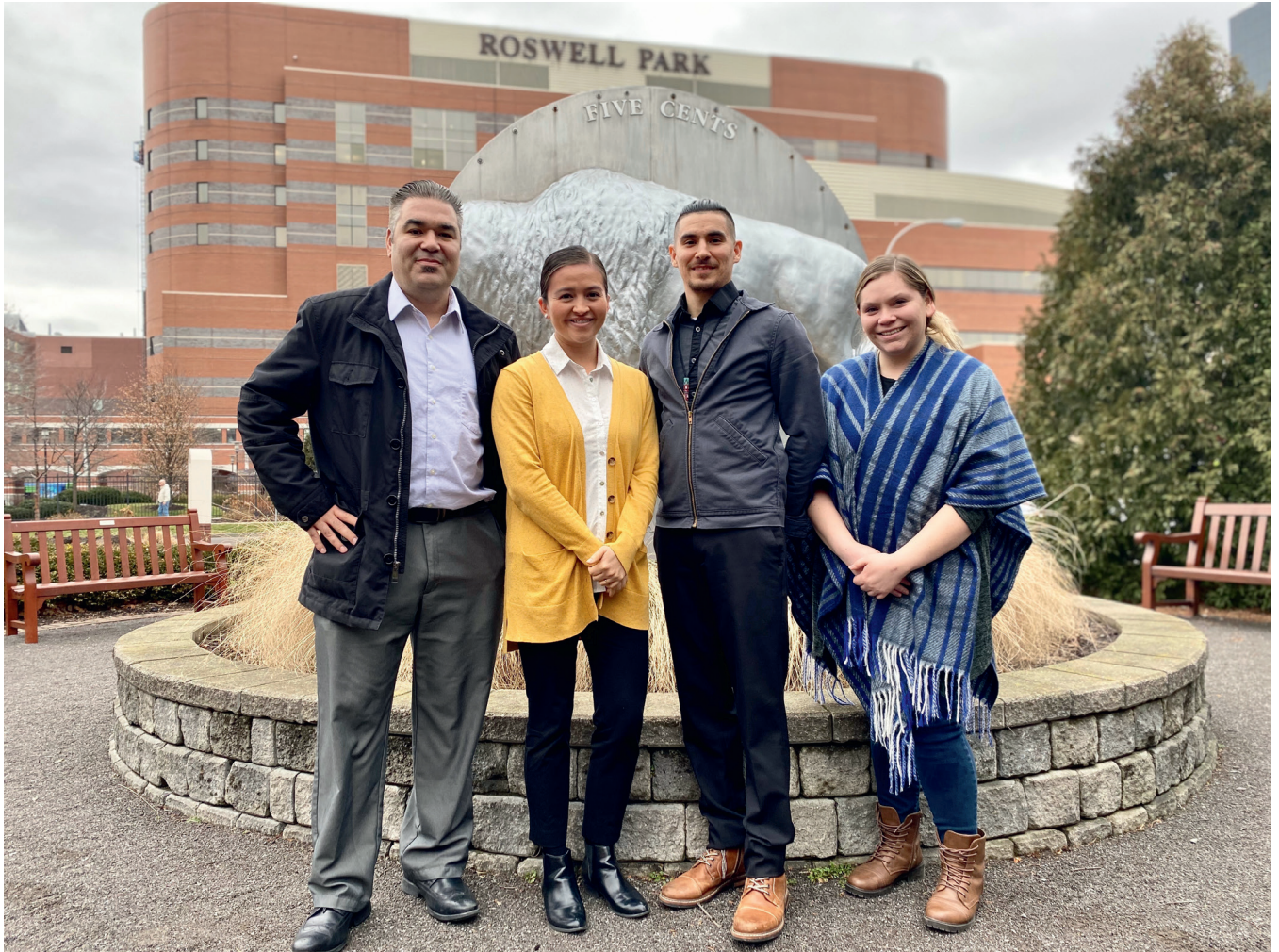
Center for Indigenous Cancer Research Staff

munities regionally, nationally, and internationally. The CICR mission is aligned with a foundational value of the Haudenosaunee, “the duty of preparing for the seventh generation,” 1 and represents the vital role of the local and regional Haudenosaunee communities.