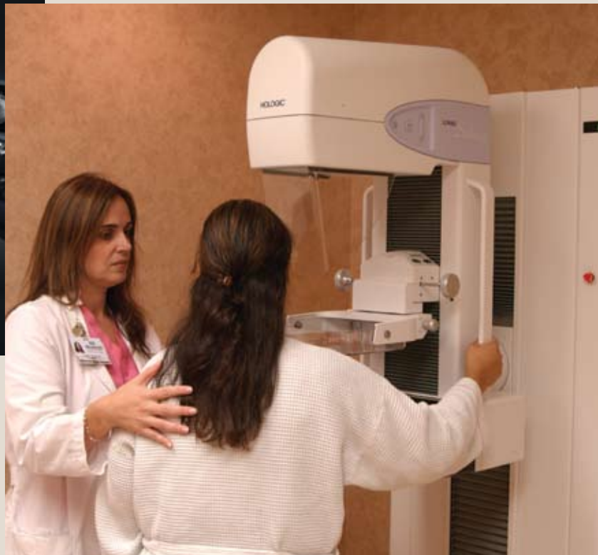
Digital mammography patient positioning.