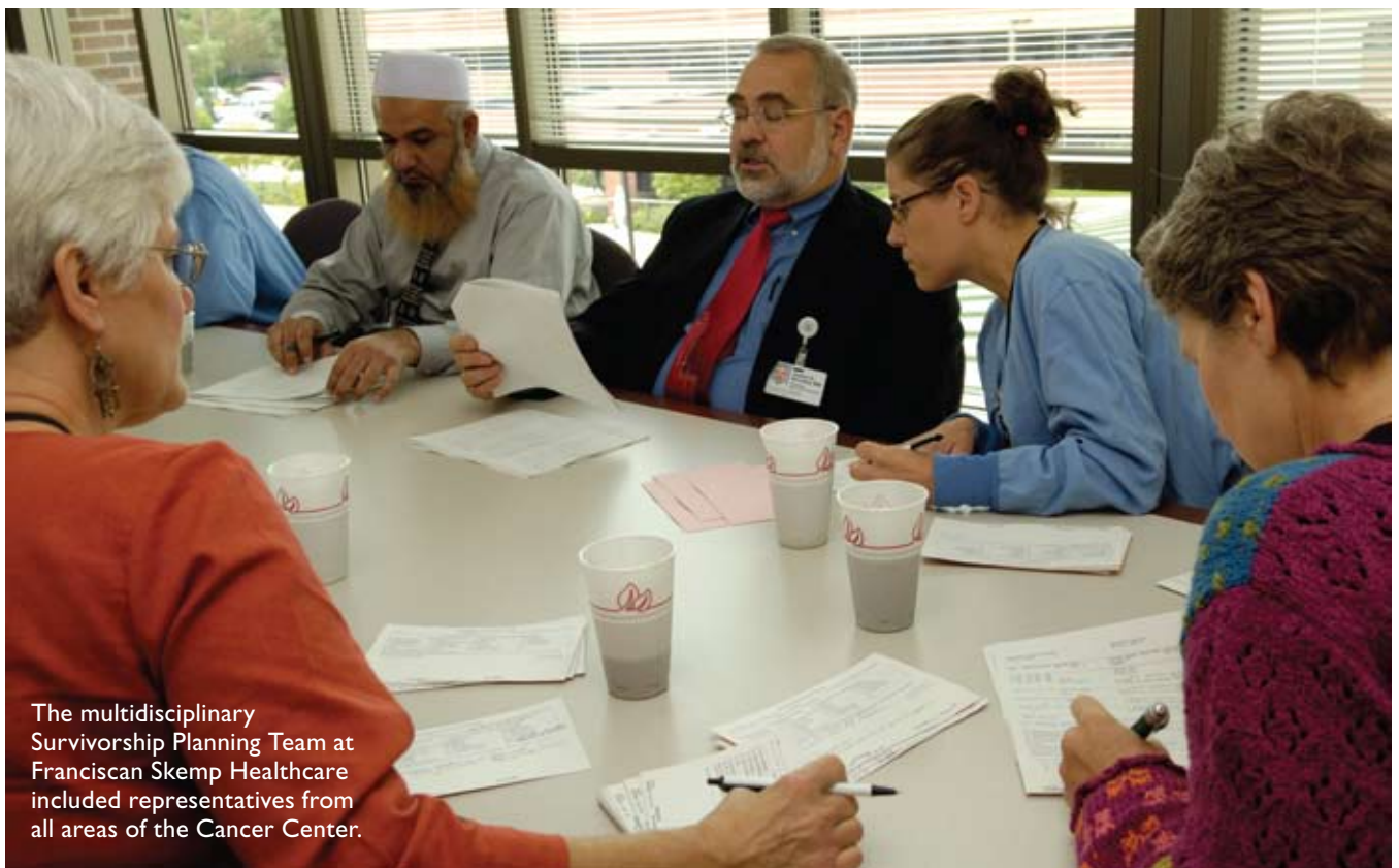
The multidisciplinary Survivorship Planning Team at Franciscan Skemp Healthcare included representatives from all areas of the Cancer Center.