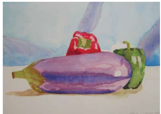
Artwork (above and below) courtesy of The Center for Cancer Care at Exeter Hospital. These works were created by participants in the cancer center's Wellness Program. See page S21 for more.