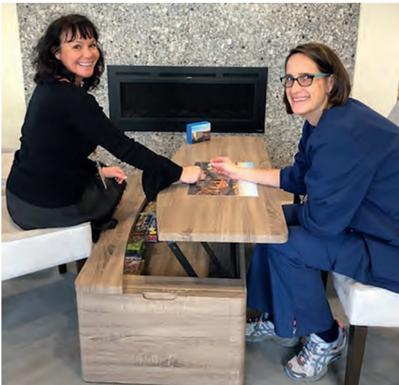
Members of the Frostbite 5K Team relax together over puzzles.