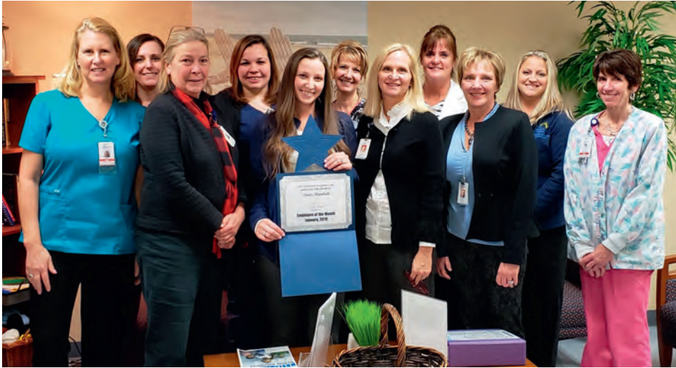
Staff at The Outer Banks Hospital celebrate the Employee of the Month.