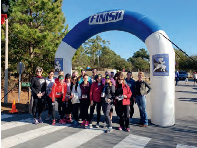
Members of The Outer Banks Hospital Frostbite 5K Team come together for an annual event.