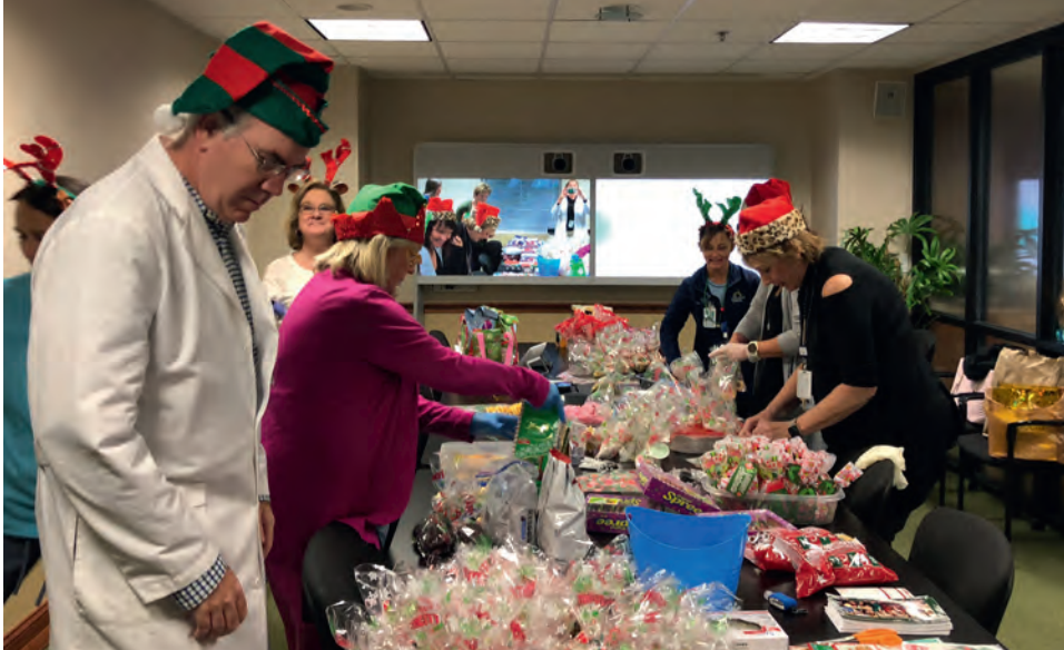
During the holiday season, individual departments at The Outer Banks Hospital assemble gift baskets for other departments as gestures of gratitude.