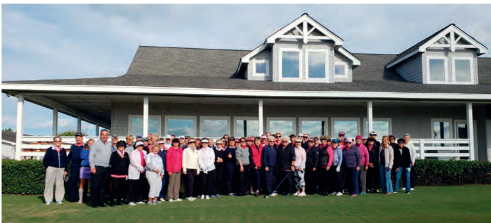
The Outer Banks Hospital hosts a golf tournament fundraising event.