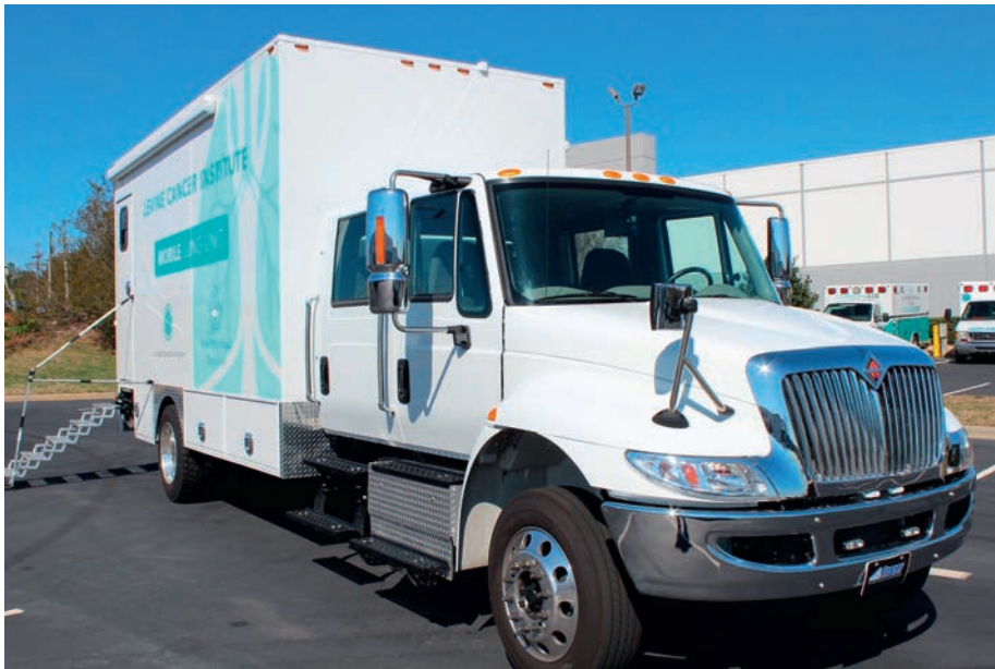
The Lung B.A.S.E.S. 4 Life truck provided screenings in six counties during its first year. Now, almost two years later, it will soon reach 11 counties across the Carolinas.

didn't have an extra dollar to spare. A member of Lung B.A.S.E.S. 4 Life team drove to her home to give the woman that dollar, and she made her appointment.