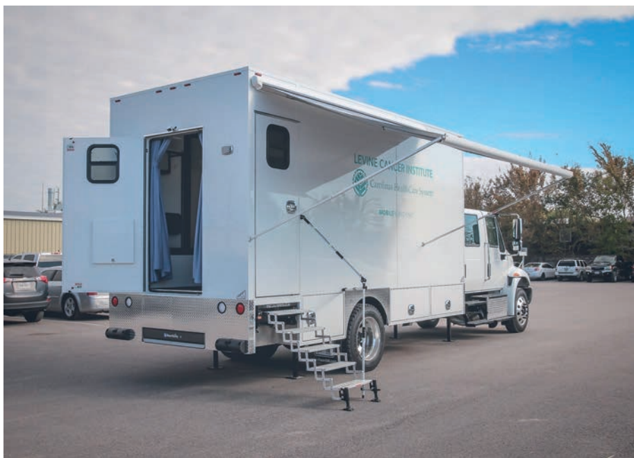
The Lung B.A.S.E.S. 4 Life truck, custom designed by Frazer, Ltd.

Healthcare can be very siloed. We think, “We’re this system and we do x, y, and z,” and “You’re that system and you do a, b, and c,” and we don’t communicate or network. Lung B.A.S.E.S. 4 Life has allowed us to reach out to community partners that never otherwise would have collaborated with our health system and bring them together to benefit patients. This outreach has become the vital component to the success of our mobile lung cancer screening unit. The success isn’t due to the bus or the screening technology. It’s due to empathy. Collaboration. The human elements. Every decision puts the patient at the center: Is this location convenient for the community? Do patients feel at ease on the bus? What other resources does this patient need to become healthy? Our mobile LDCT unit is more than technology; it’s a philosophy of care. Our team operates under the mission that until every patient is seen, we can’t stop doing what we do.