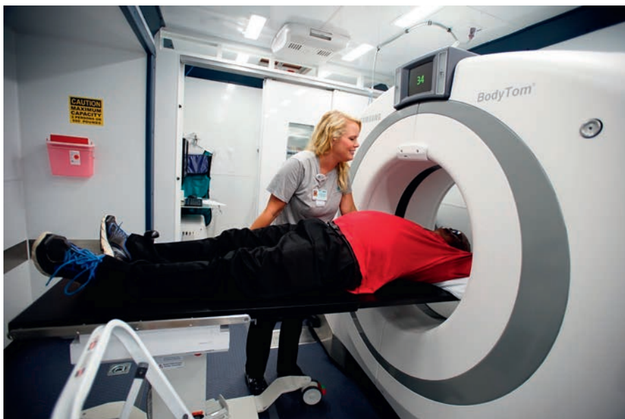
A patient enters the BodyTom CT, a scanner developed by Samsung Neurologica specifically for the Lung B.A.S.E.S. 4 Life program.