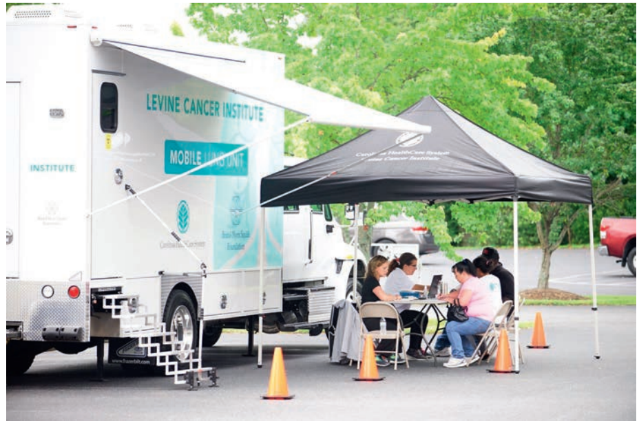
The Lung B.A.S.E.S. 4 Life truck, custom designed by Frazer, Ltd.