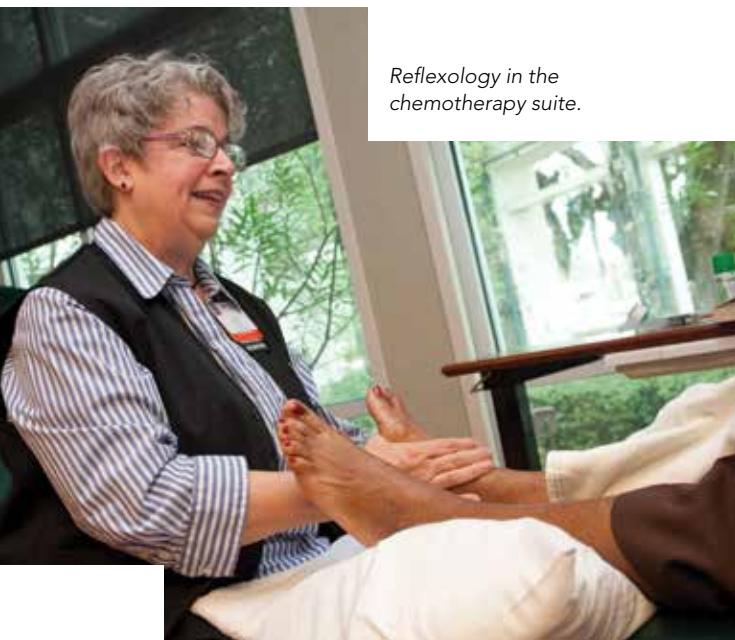
Reflexology in the chemotherapy suite.