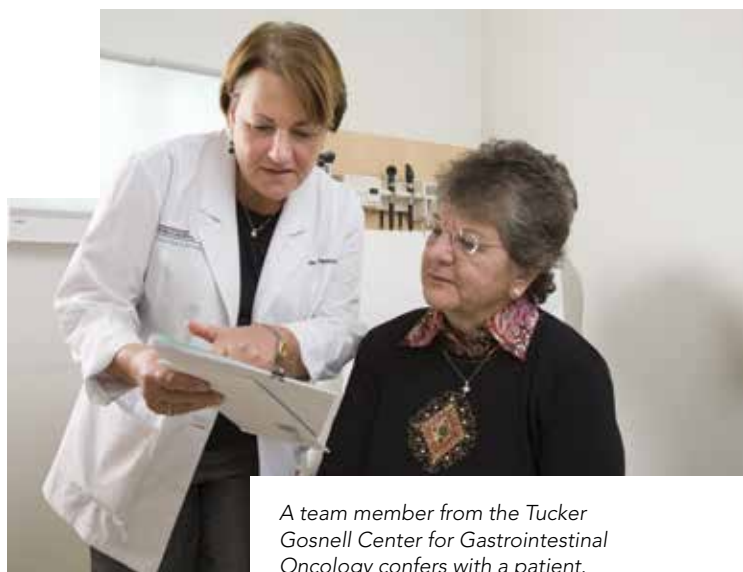
A team member from the Tucker Gosnell Center for Gastrointestinal Oncology confers with a patient.