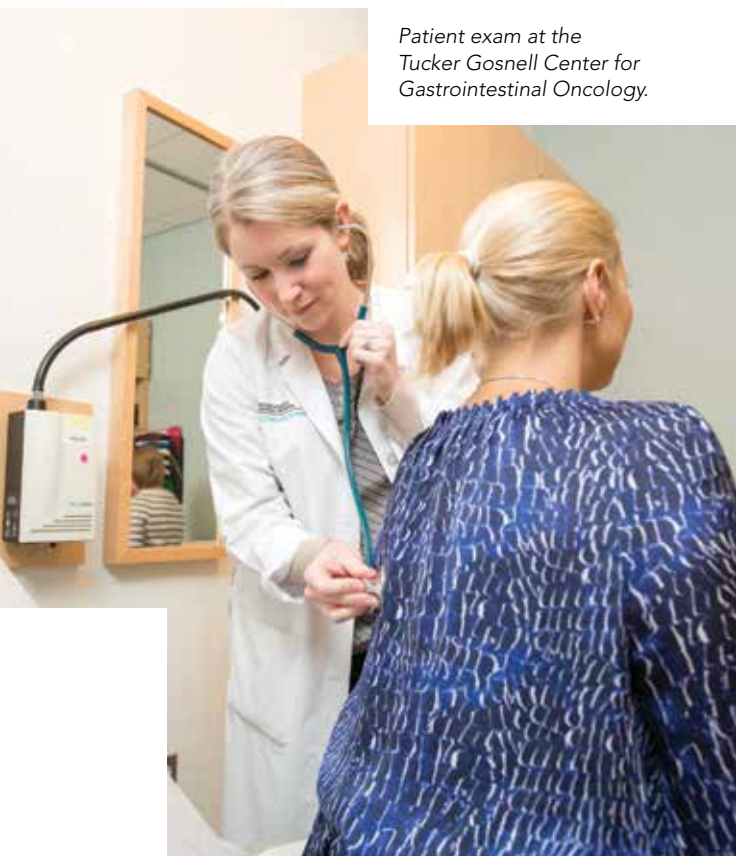
Patient exam at the Tucker Gosnell Center for Gastrointestinal Oncology.