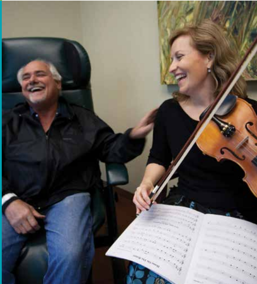
(Top to Bottom)