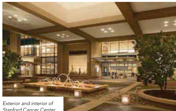
Exterior and interior of Stanford Cancer Center.