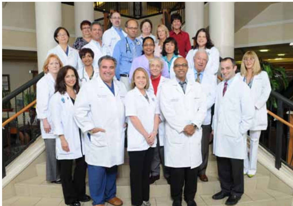
Broward Health - Broward General Medical Center, Broward General Comprehensive Cancer Center, Fort Lauderdale, Fla.

discussed. ACCC testified without the other members of the pharmacy stakeholder group; however, they were in attendance to support ACCC and its efforts. After the testimony was completed, the HOP recommended to CMS the following, all of which were recommendations asked for in ACCC's testimony: 1. Reimburse drugs and pharmacy overhead at ASP+6 percent; 2. Freeze the packaging threshold at the current level; 3. Require hospitals to code all drugs on the 0636 revenue code line; 4. Separate out 340B drug data from the calculation for ASP+X percent.