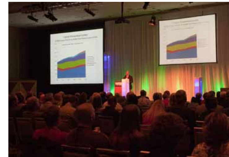
ACCC 28th National Oncology Conference, Seattle, Wash.

As Association members continue to face pressures and challenges to their ability to deliver the highest-quality cancer care, ACCC will continue to be the “how to” resource for maintaining the quality of and access to that care.