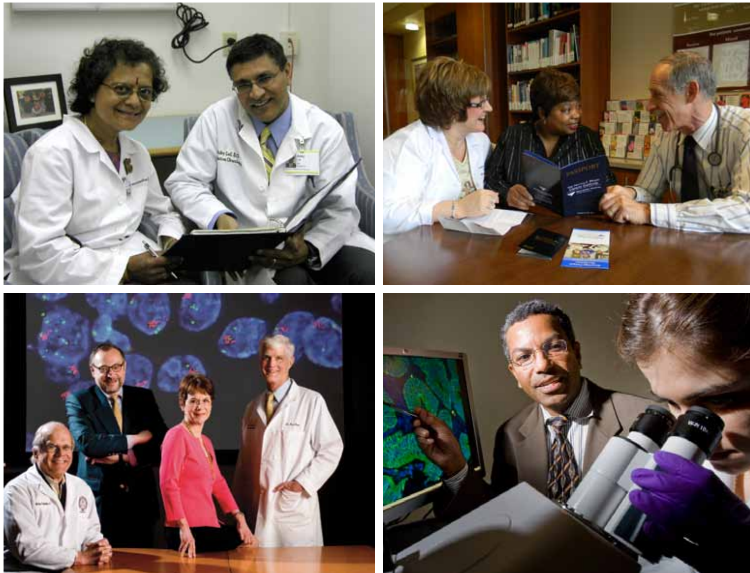
Pictured opposite page, clockwise from top right: Bridgeport Hospital, Norma F. Pfriem Cancer Institute, Bridgeport, Conn.; Christiana Care Health System, Helen F. Graham Cancer Center, Newark, Del.; University of Colorado Hospital, University of Colorado Cancer Center, Aurora, Colo.; Methodist Medical Center of Illinois, Peoria, Ill.