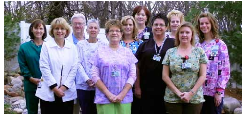
Freeman Health System, Freeman Cancer Institute, Joplin, Mo.