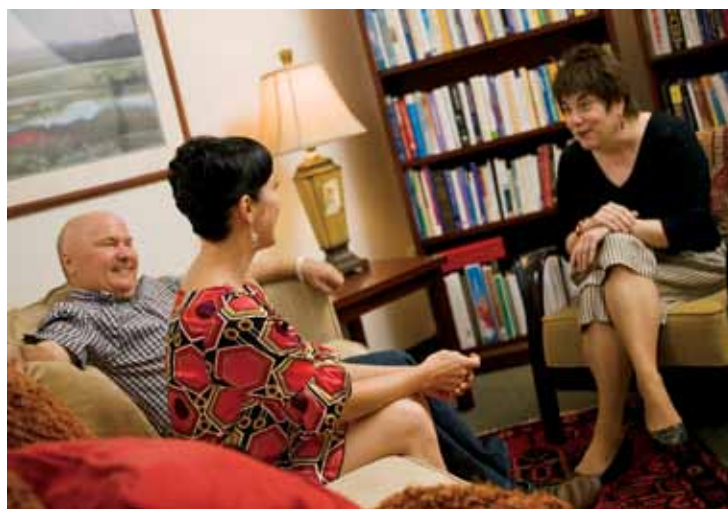
Cancer Care Northwest, Spokane Valley, Wash.

ACCC leaders believed that further NCI funding for community clinical research would be limited without increased community participation within the ranks of NCI itself. In 1978, Congress renewed the National Cancer Act, which was amended to include, for the first time, an emphasis on community care. The Act also called for community representation on the National Cancer Advisory Board.