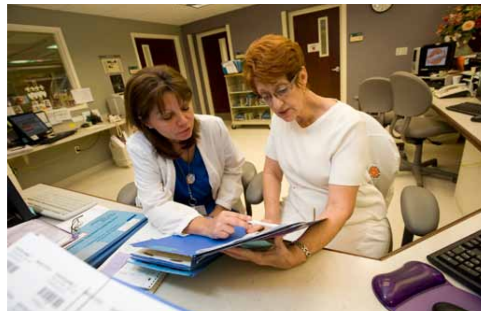
Memorial University Medical Center, Curtis & Elizabeth Anderson Cancer Institute, Savannah, Ga.

The Clinical Affairs Committee is charged with 1) identifying new treatments, leading clinical trials, and oncology trends that affect membership, 2) identifying new technologies in oncology, and 3) bringing these to the attention of