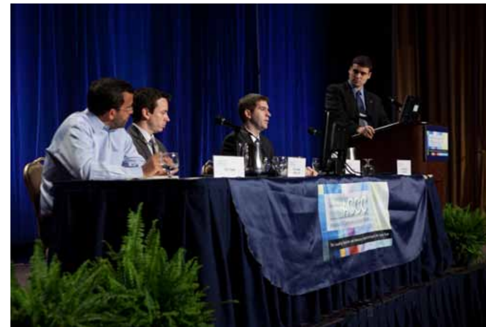
ACCC 37th Annual National Meeting, Washington, D.C.

Medicare coverage policies and off-label issues continue to be a primary area of focus for ACCC. The Association has emerged as a leader in this area, and is committed to ensuring that our members' views are considered as policies are developed. ACCC works to ensure patient access to new oncology drugs. ACCC spearheaded efforts to make citation of a cancer drug in any of the standard reference compendia sufficient to require insurers to pay for its use outside of FDA-labeled use. To date, 39 states have passed ACCC's off-label legislation and similar language is in Medicare and Medicaid statutes.