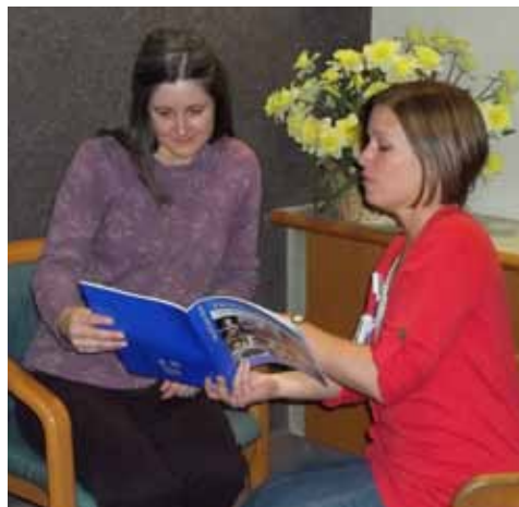
Penrose-St. Francis Health Services, Colorado Springs, Colo.