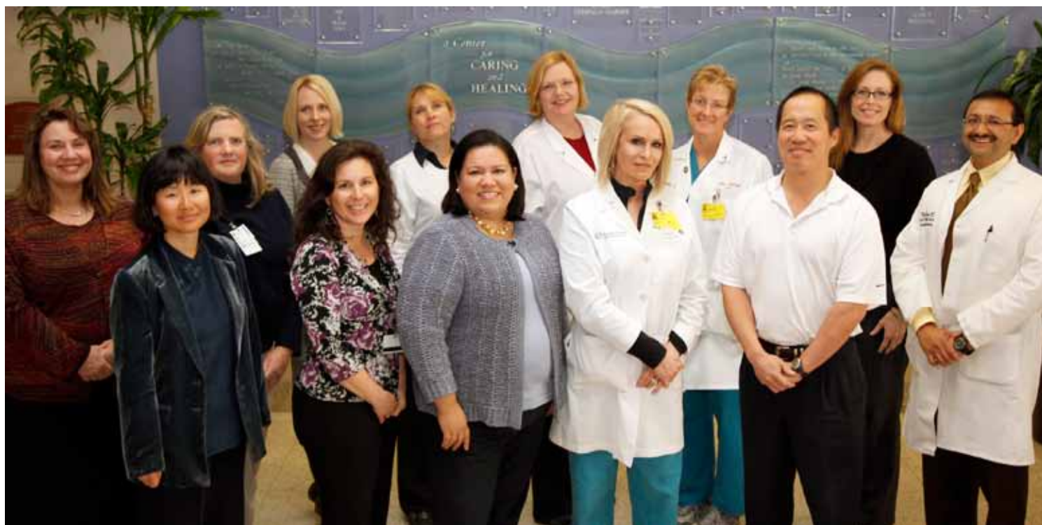
Sutter Medical Center, Sacramento, Sutter Cancer Center, Sacramento, Calif.

The Financial Information and Learning Network for Community-Based Cancer Programs. This program is designed to provide needed resources and expand the skills and knowledge base of providers who deal directly with patients on complex financial issues surrounding their cancer diagnosis and treatment. With member assistance, we will identify effective practices, resources, and tools for inclusion on ACCC's website. We will develop and deliver a multi-component online course that will cover the basics of financial counseling, as well as include more technical and comprehensive pre- and post-treatment financial planning and support. In addition, we will develop financial counseling guidelines and provide live, regionally based education sessions that will offer participants an interactive forum to share successes and solutions.