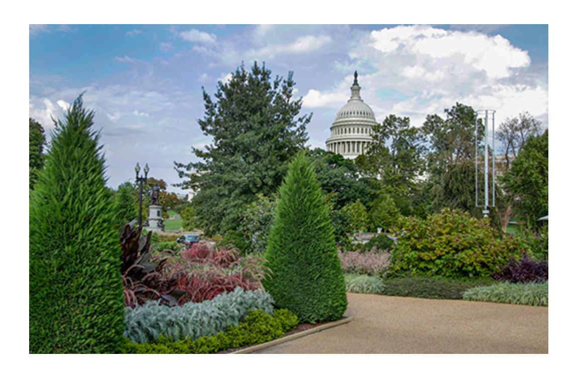
United States Botanic Garden

One of the oldest botanic gardens in America, this living plant museum educates and inspires with its almost 10,000 living specimens. Visitors will be amazed by the rich history and irreplaceable value of the flora and fauna as they explore the many wonders on the U.S. Botanic Garden's campus including the Conservatory, National Garden, and Bartholdi Park.