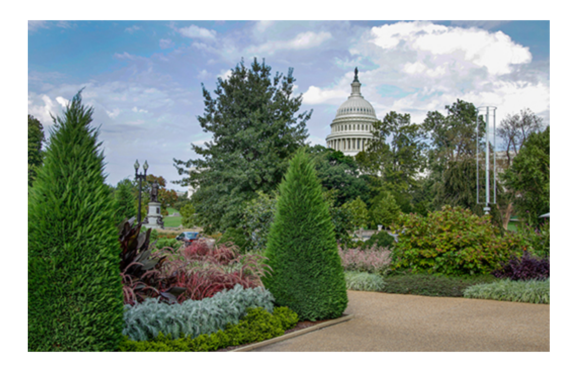
United States Botanic Garden

One of the oldest botanic gardens in America, this living plant museum educates and inspires with its almost 10,000 living specimens. Visitors will be amazed by the rich history and irreplaceable value of the flora and fauna as they explore the many wonders on the U.S. Botanic Garden's campus including the Conservatory, National Garden, and Bartholdi Park.