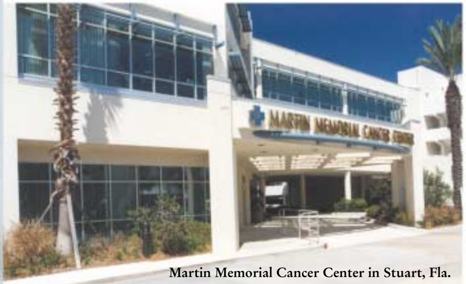
Martin Memorial Cancer Center in Stuart, Fla.

PHOTOGRAPHS COURTESY OF MARTIN MEMORIAL CANCER CENTER