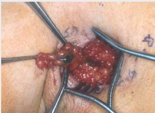
Figure 2. A small incision is targeted directly over the sentinel lymph node by measuring the radioactivity of the hot node with a gamma counter. The blue sentinel lymph node can be clearly distinguished and dissected free from surrounding tissue and (non-sentinel) lymph nodes.

The hypothesis of the Florida Melanoma Trial (FMT) is that patients with a positive SLN who undergo CLND have no disease-free survival or overall survival advantage when