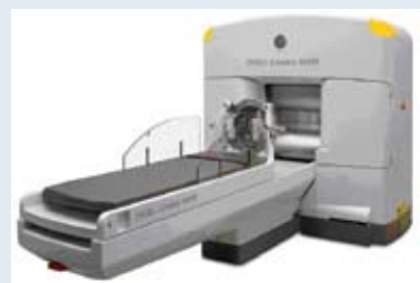
Figure 2: The Gamma Knife® uses a light-weight head frame, which is affixed to the patient, for immobilization.