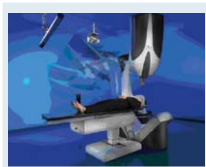
Figure 4: The CyberKnife® uses a plastic mask for patient immobilization.

The CyberKnife is another capable SRS system for treating brain lesions, but its design has expanded SRS for lesions anywhere in the body, including structures that move with respiration. While the Gamma Knife treats