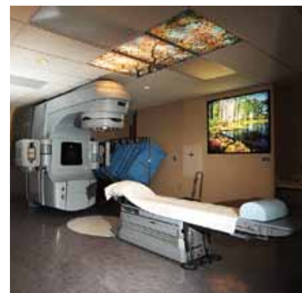
Radiation therapy treatment rooms feature specially designed light boxes that provide relaxing views of nature.