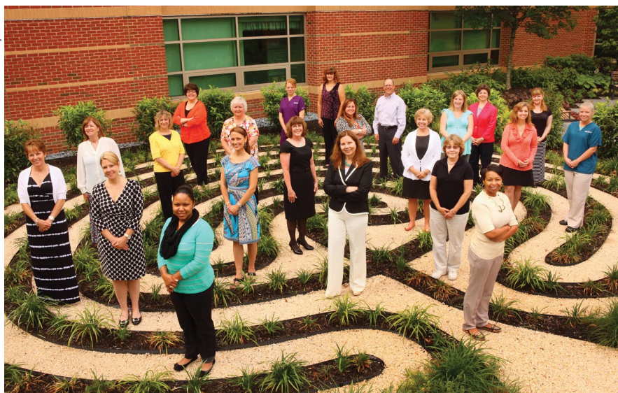
The Cancer LifeNet team provides free navigator and supportive care services to individuals and their families helping them balance work, family, and cancer treatment.

Since the program first started in 2006, the Cancer LifeNet (CLN) team has helped patients cope with their cancer from diagnosis, through treatment, and well into recovery. Centrally located on the first floor of the cancer center, CLN includes oncology nurse navigators and oncology-certified social workers who provide critical health education and support to residents of Harford and Cecil counties at no cost, regardless of their cancer diagnosis or where they are receiving medical treatment. The nurse navigators are supported by a network