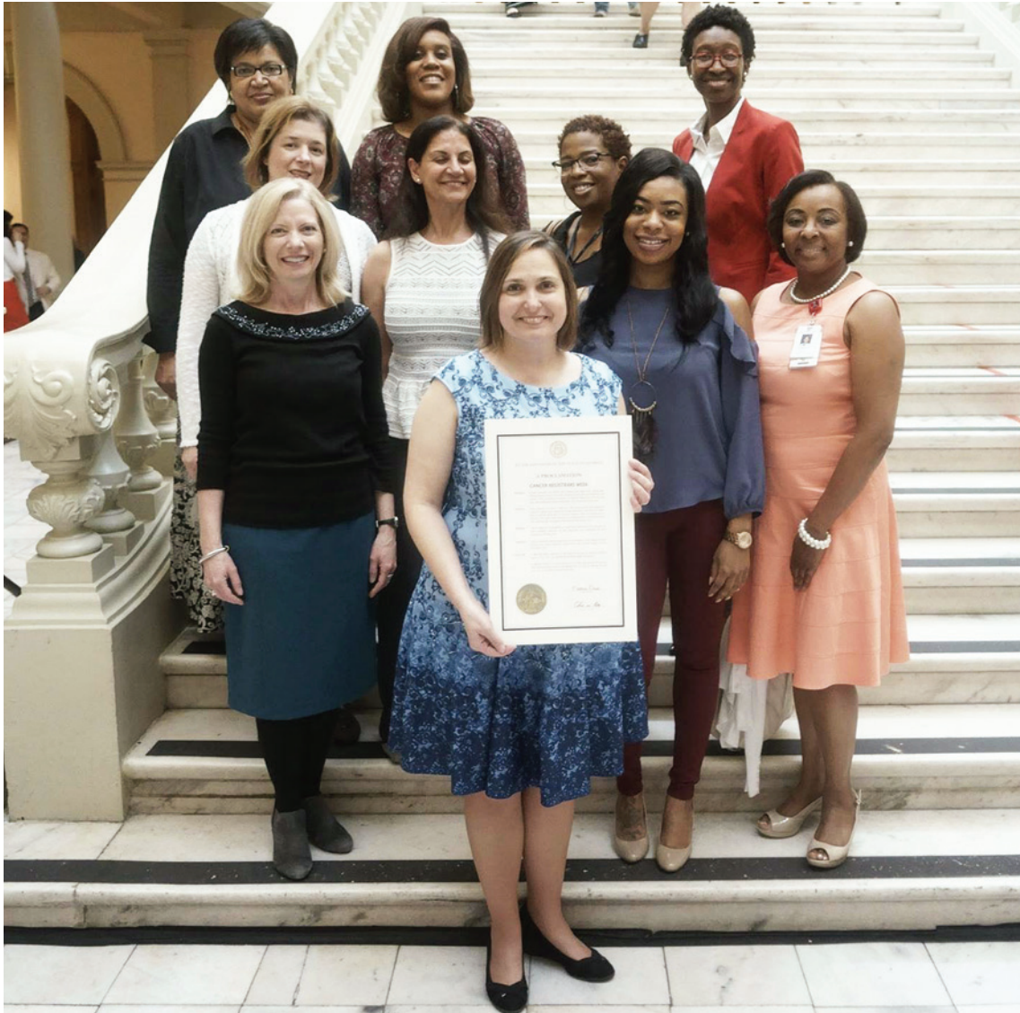
Northside Hospital's Cancer Registry team celebrates National Cancer Registrars Week with a proclamation signed by Georgia Governor Nathan Deal.

that is delivering SCPs has the forms on hand so when the patient comes for their visit, the nurse puts one of each sheet into the folder and hands it to the patient. Because these forms are preprinted, it takes the nurse less than 5 minutes per patient to stuff the folder before the visit. Sometimes the oncology analytics department gets volunteers who are happy to stuff these folders as well, and they get delivered to the doctor offices all ready. The treatment summary that was uploaded to the shared drive is then reviewed with the patient, printed, and added to the survivorship care folder. Once the visit has taken place, the treatment