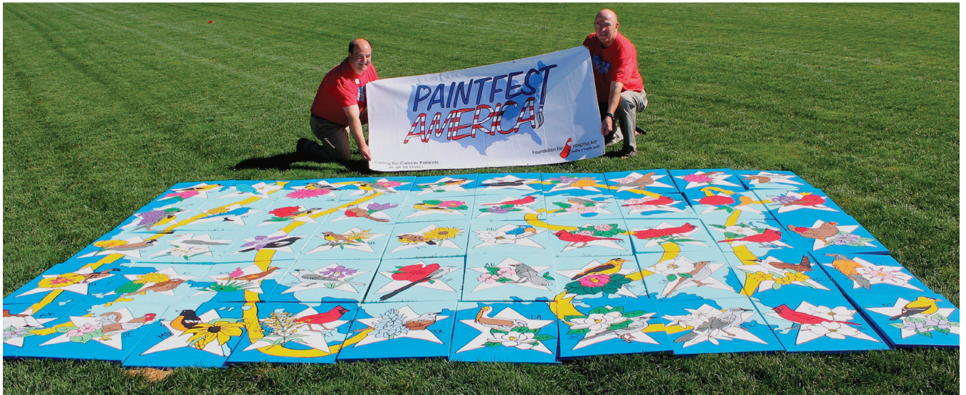
Top: 2016 PaintFest America participants. Bottom: “Stars of Hope” mural.