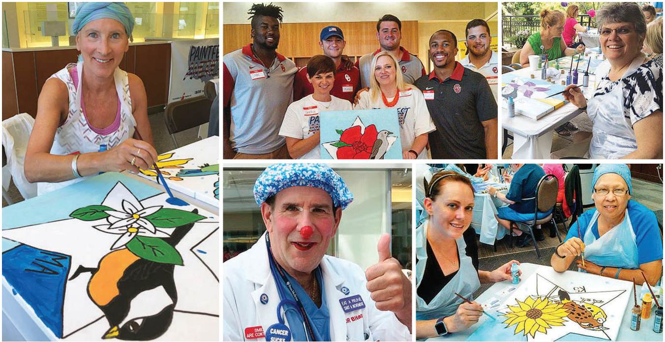
2016 PaintFest America participants.