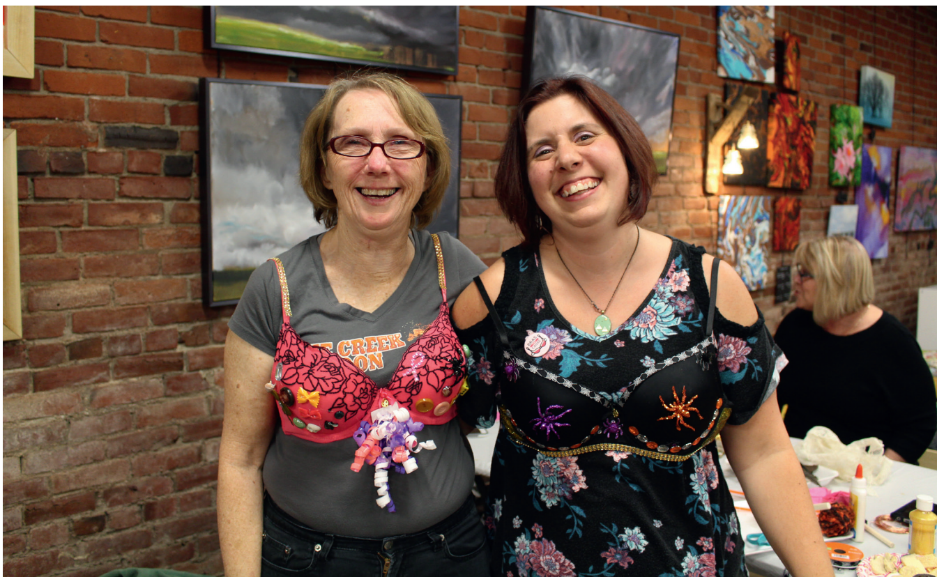
(Top and bottom) During Breast Cancer Awareness Month, ArtsCare hosts a “Bras for a Cause” event where bras are decorated and modeled by participants.