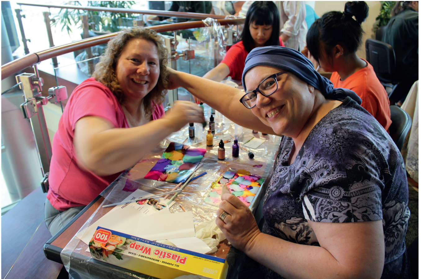
Participants enjoy exploring their creativity as part of the Saturday ArtsCare Workshop series offered monthly.

in the infusion department has had unexpected benefits. We had not anticipated the degree to which live music can provide a positive distraction, enabling patients to take a mental “vacation” from the medical treatment to which they are tethered. Patients and their support companions tell us that time goes by faster when they are listening to live music and report an increased sense of well-being. Artists describe physical transformations they observe in those who engage with the music—calmer breathing, relaxed facial expressions, more smiles. Staff always look forward to the days when musicians are present as much as the patients do.