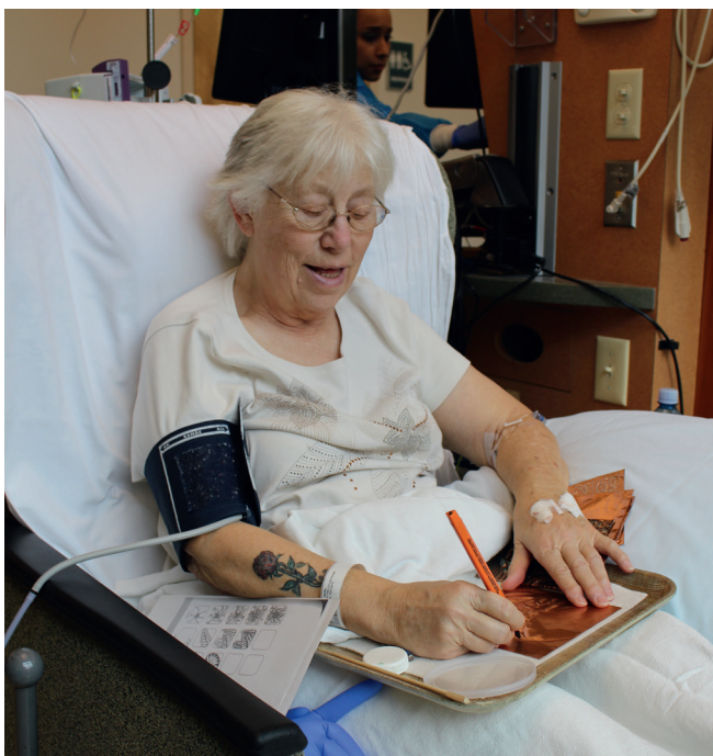
(Top) Staff from the surgical department enjoy a break from their busy day to work on a copper tooling project together. (Bottom) A patient at Samaritan's Emehiser Infusion Center works on her copper tile while receiving treatment.