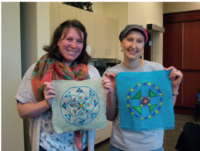
(Top) Saturday ArtsCare workshop participants create colorful mandalas. (Bottom) A cancer patient and her best friend proudly display their finished mandalas.

shop series. Each year, the coordinator develops an annual report on participation in ArtsCare activities.