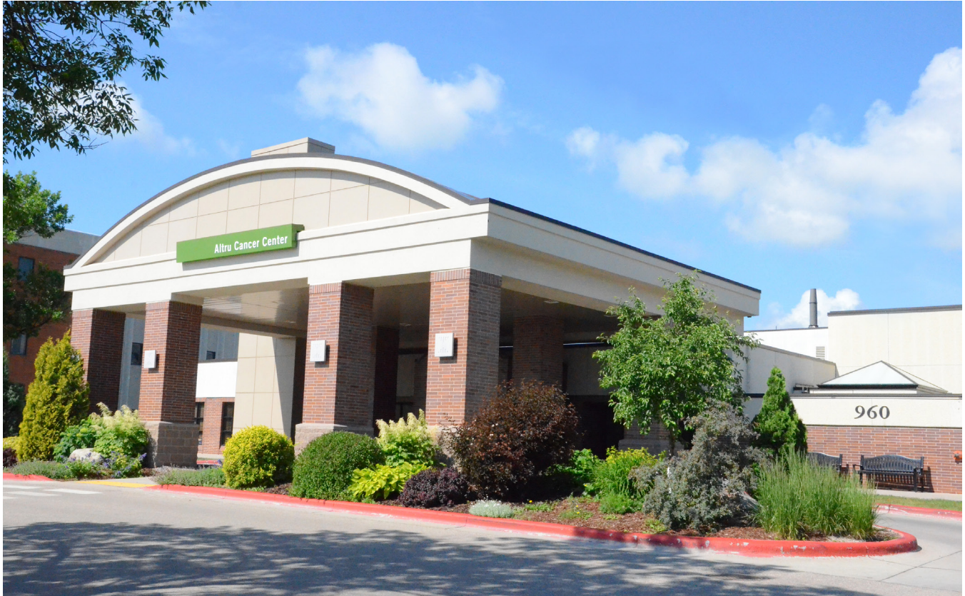
Altru Cancer Center

volume of patients with ALL at Altru Cancer Center ( n = 6 from 2018 to 2020) compounds this collective sense of unfamiliarity with management considerations specific to ALL and presents few opportunities for nurses to build competency in managing patients with this disease. To build clinical competency, the seven participants who attended the workshop in March, including nurses, the chaplain, a clinical nurse educator, a family nurse practitioner, and the director of cancer services, agreed to focus their QI intervention on supporting nurses to meet Oncology Nursing Society (ONS) standards for performing ALL induction, consolidation, and salvage treatment.