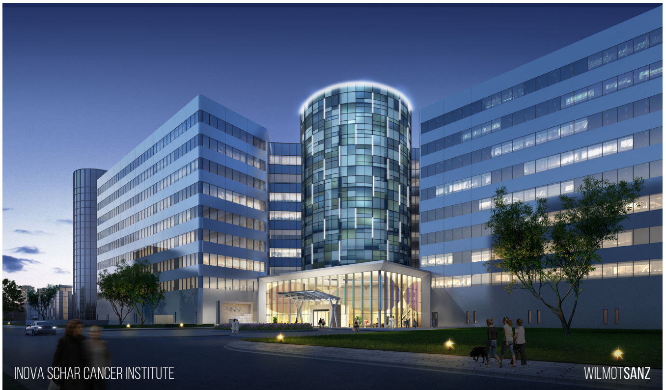
Inova Schar Cancer Institute

are transferred to the oncology inpatient unit and connected with an inpatient program (Life with Cancer) to address psychosocial concerns, fertility preservation, and insurance-related issues. After the inpatient stay, patients transition to the outpatient clinic with the support of a nurse navigator.