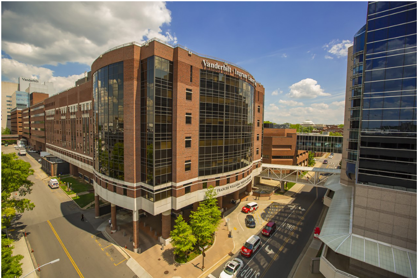
Vanderbilt University Medical Center