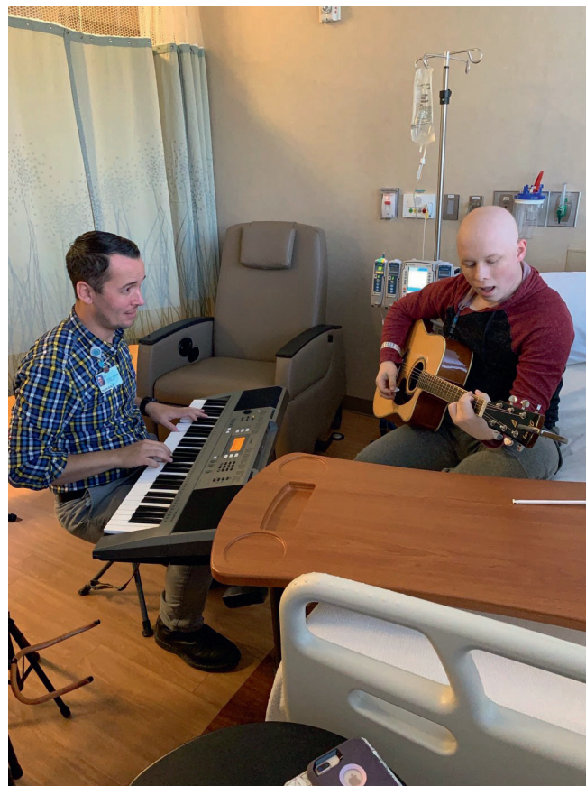
Quick and a patient engaged in dyadic music-making.

Digital instruments also improve accessibility for those with physical limitations. Many, such as keyboards and electronic drums, have sizable silicone pads that can be programmed or assigned virtually any sound imaginable. For example, because of the flexibility of digital instruments, someone with neuropathy affecting their hands could benefit from music therapy. They might not be able to strike the keys of a typical keyboard, but they can strike a larger silicone pad assigned a sound of their