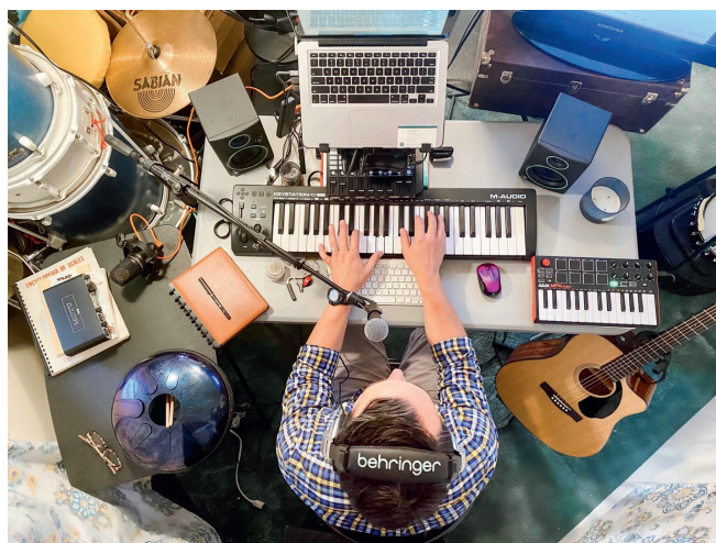
Overhead view of Quick's telehealth set up in his personal studio.