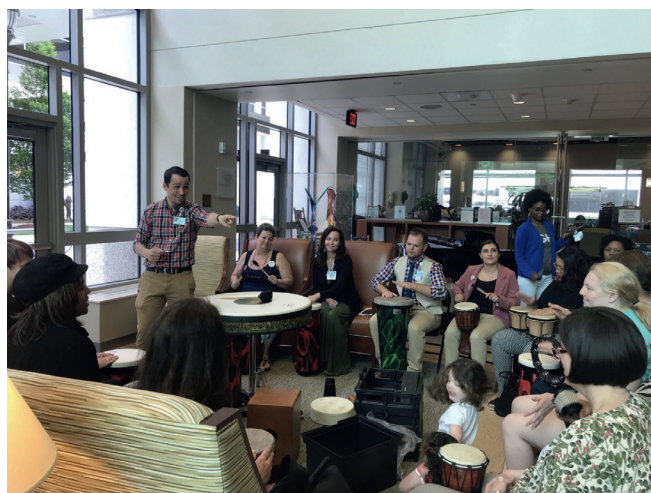
Group Drumming event for the LCI Healing Arts Celebration 2018.