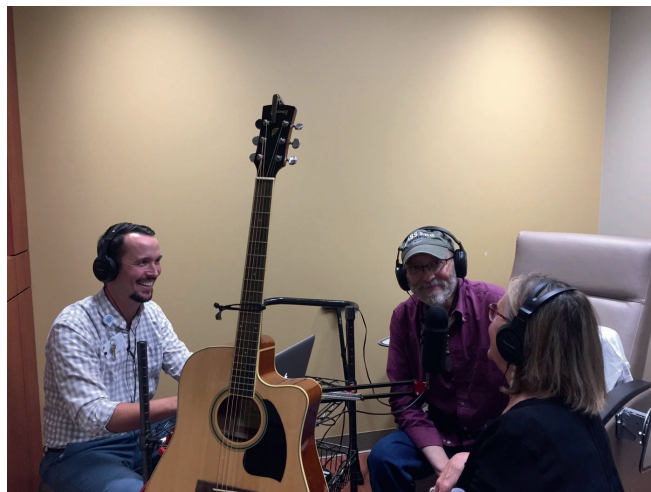
A patient and wife singing and recording their original song.