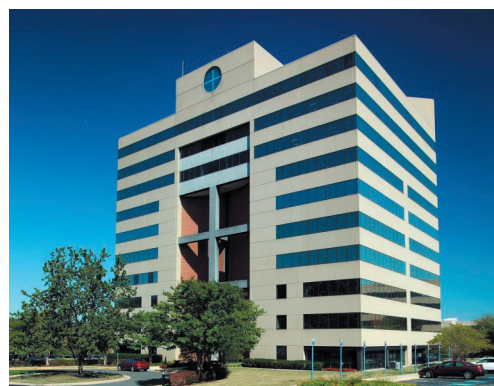
Maryland Oncology Hematology corporate headquarters in Calverton, Md.