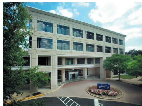
Clinic location in Bethesda, Md.