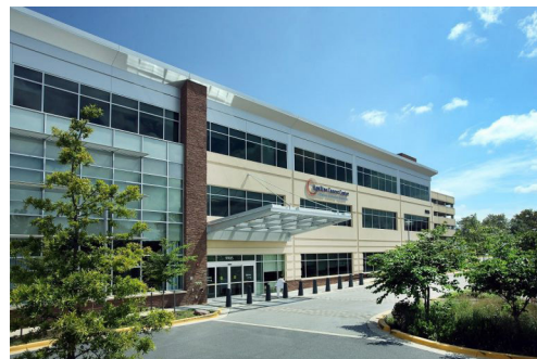
Clinic location in Rockville, Md.