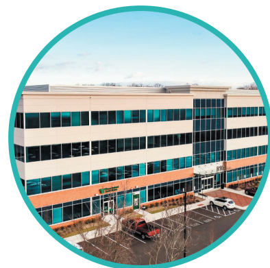
Clinic location in Annapolis, Md.

M aryland Oncology Hematology is one of the largest independent oncology practices in Maryland, serving patients in the state and the metro Washington, D.C., area. With 14 physician-owned locations, Maryland Oncology Hematology provides its communities value-based and integrated cancer care close to home through its dedicated staff and membership in the US Oncology Network.