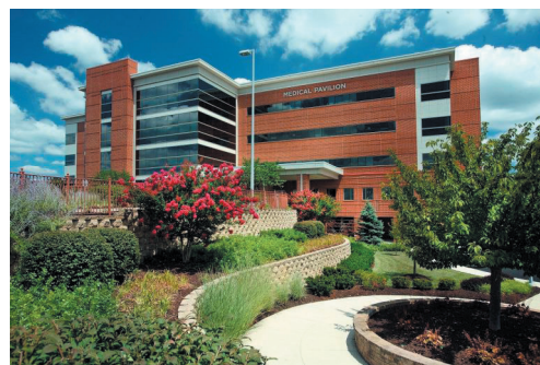
Clinic location in Columbia, Md.