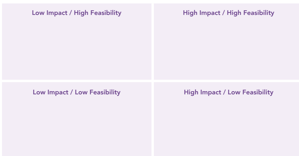
Figure 1: Example Prioritization Grid